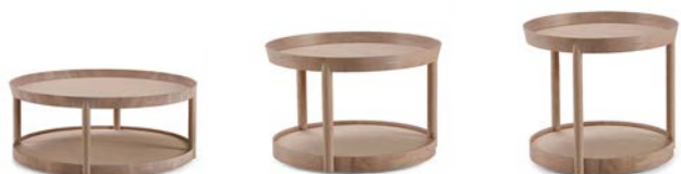
ARCHIPELAGO Table By Michael Sodeau