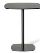
NOBIS Table By Claesson Koivisto Rune