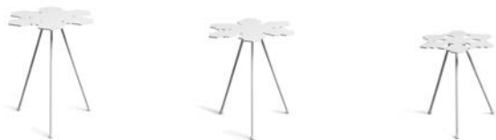
SNOWFLAKES Table By Claesson Koivisto Rune